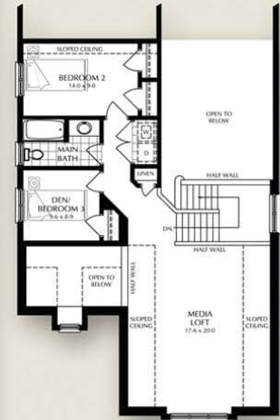
Loft Plan Layout 'B'