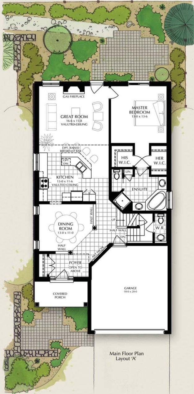
Main Floor Plan Layout 'A'