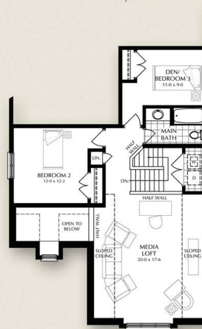
Loft Plan Layout 'A'