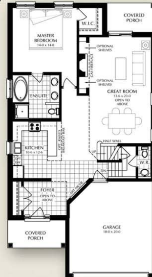
Main Floor Plan Layout 'B'