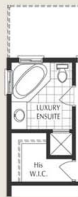
OPTIONAL LUXURY ENSUITE LAYOUT